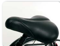
E12 - Comfort saddle PU + plastic