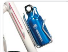
E7 - Drink holder (cannister not included)