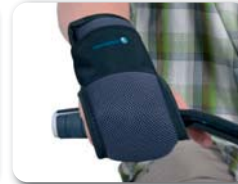
E11 - Closed hands holder