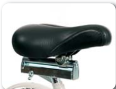
P4 - Adjustable saddle (140 mm)