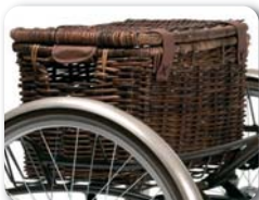
E4 - Vintage Basket