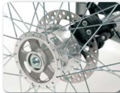
B1 - Disc brake for the rear wheel