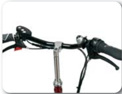
S2 - Flat steering