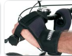
E10 - Hands holder with straps