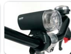
E2 - Lighting system (batteries included)