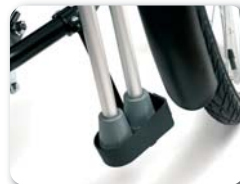
E6 - Crutch holder