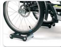
E13 - Hometrainer