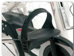
F1 - Pedals with strap