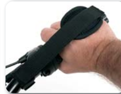
E9 - Hand straps