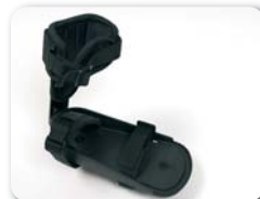
F4 - Foot support with Velcro straps & ankle support