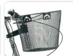
E14 - Front basket