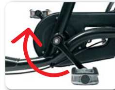
O2 - Torpedo brake