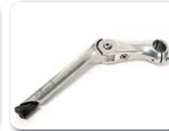
S5 - Adjustable steering bracket (-10° to +50°)