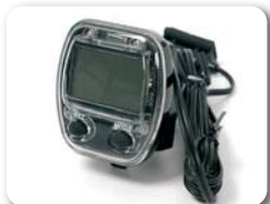
E3 - Odometer (batteries included)