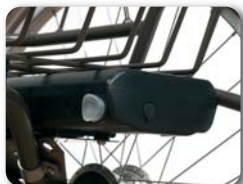
BAT 9 - BAT 13 - Extra battery E-bike (9A or 13A)