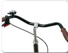
S3 - City steering