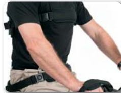
P3 - Pelvic and back support