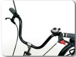
S1 - Classic steering