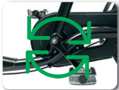
O6 - Fixed wheel