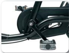
O1 + B1 - Free wheel