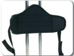
P1 - Pelvic support