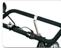
S4 - Rectangular steering