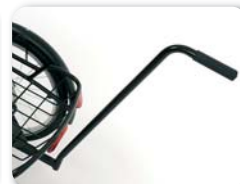
E1 - Pushing handle (335 mm or 605 mm)