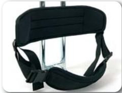
P2 - Back support