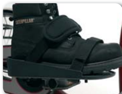
F3 - Foot support with Velcro straps