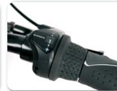
O3 - 3 gears