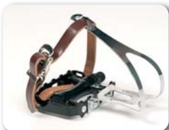
F2 - Pedals with toes clip & strap