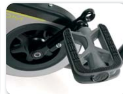
F5 - Pedals with adjustable length (22 mm)