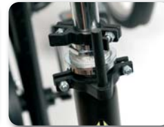
D1 - Steering limiter