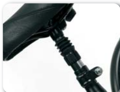
P5 - Saddle tube with shock absorber