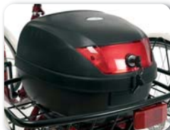
E5 - Lockable topcase volume: 30 liter