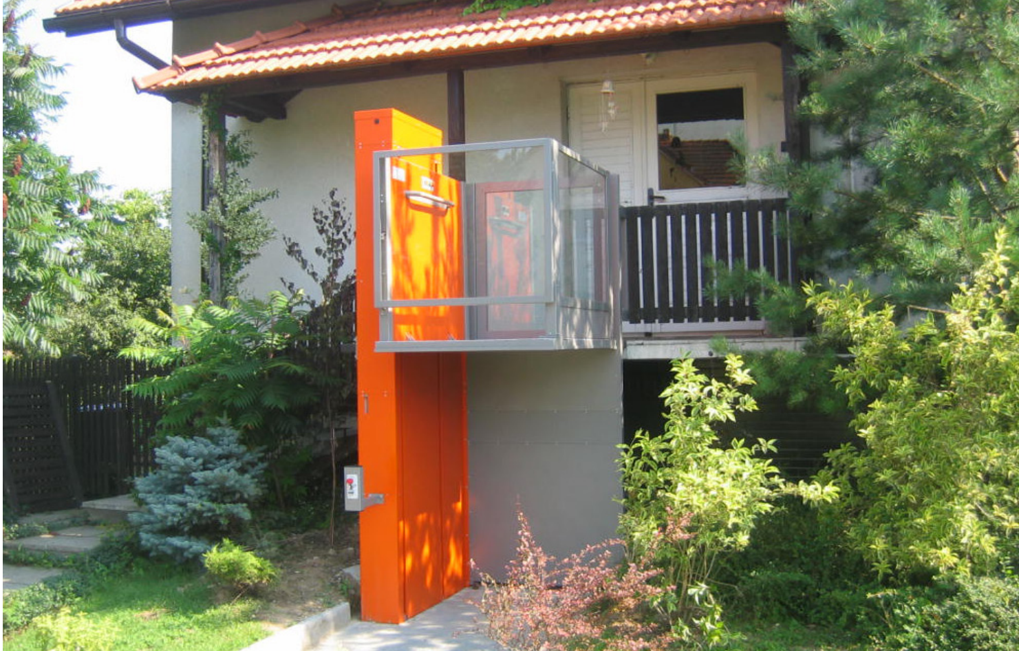
Special RAL colour for parts of the lift installation