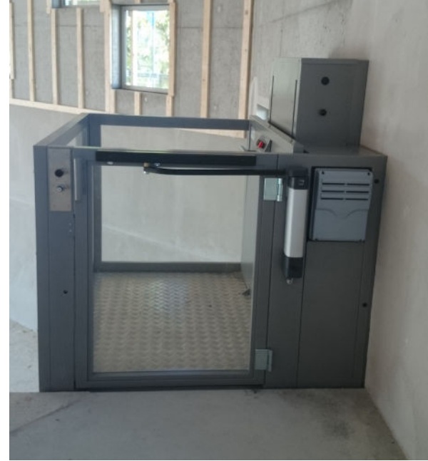
Upper gate with automatic door opener