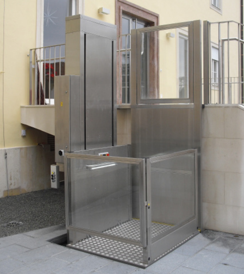
Lift with 70mm pit and execution in stainless steel