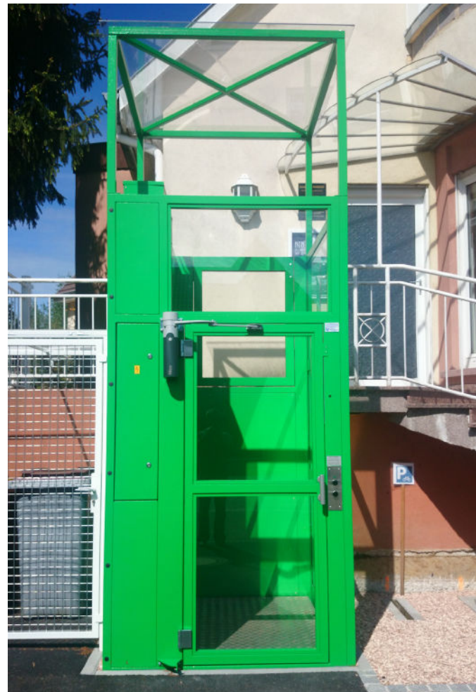
Glas shaft with roof and special colour

Especially designed for outside installation, the double-chain drive and the robust electrics provide for a safe drive and a low-maintenance operation.