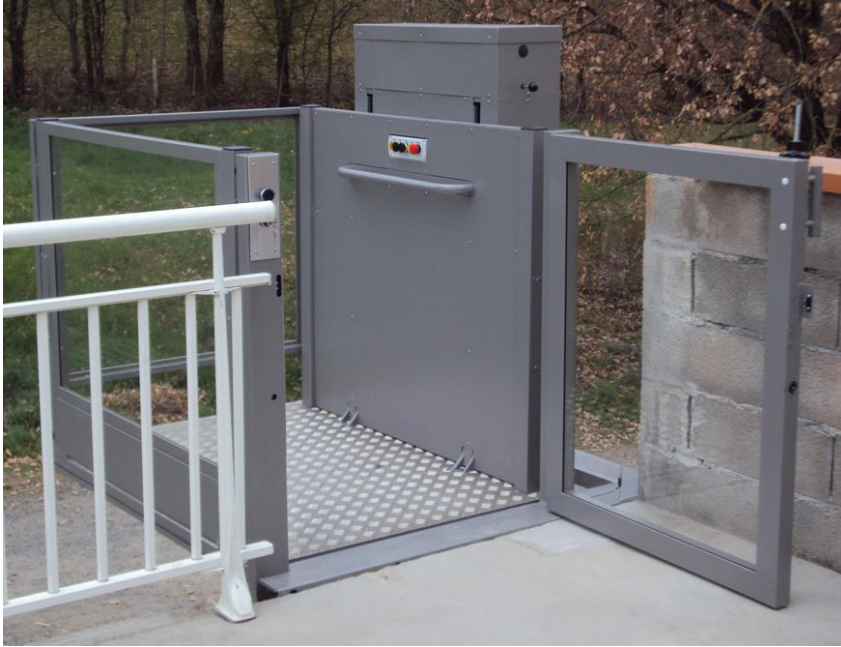
Upper gate can be manual or automatic