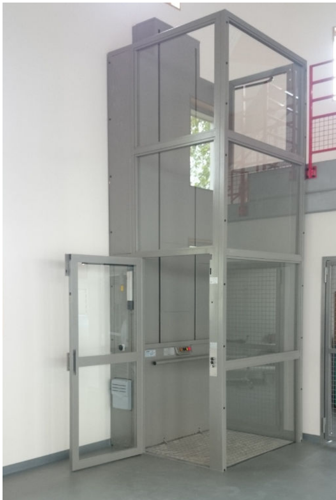
Glas shaft with steel or aluminium frame as an option